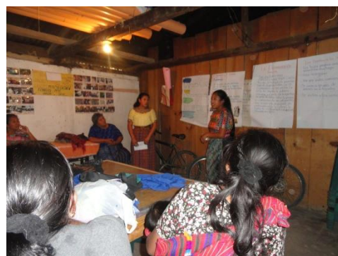
Ilustración 7 Women in Patanatic learn about solutions for dealing with family issues

Through two workshops with the artisan women in each community the students explored the theme of Disintegration, including role plays, explanations and frank and open discussions from both students and women participants about their realities and behaviors that can negatively affect the family unit and lead to its break down. This led to open discussions in each community about the ways in which family disintegration can be combated and how to deal with such issues as drug abuse and domestic violence. This theme was also explored with youth in each community through the organization of a youth focused activity. In total 78 women participated in the workshops and 133 youth participated in workshops and activities to promote discussion on causes and solutions to creating harmony at home.