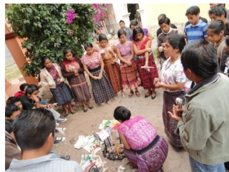
Ilustración 5 Youth participating in a Mayan Ceremony

On the 19 th of April, all sponsored students from grades 10-12 (38) came together to celebrate the beginning of the year with a workshop. Every year this workshop theme is selected based on recommendations by the youth participants in the previous year's workshop. This year the theme was, The Cosmovision Maya, and was led by a Spiritual Guide, (Sacerdote Maya). This workshop provided students with a space in which to comfortably explore their own Maya heritage and to better understand why and how these traditions are passed on from generation to generation. Students were excited at the opportunity to be able to learn more about the Cosmovision Maya and how it pertains to their identity as young indigenous people.