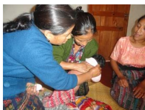
2 Traditional healers attend to a child patient in community clinics

The clinics held in the communities proved to be very popular and there were very high levels of attendance. Each clinic was attended by a minimum of two Mayan Healers and one youth participant. In villages where a higher number of patients were expected at times three healers attended to patients in order not to turn away people interested in treatment. 662 medicinal plants and plant remedies distributed and a total of 551 patients were attended in the communities of Panajachel, Patanatic, Chaquijya, San Andrés Semetabaj, Chirijox, San Antonio Palopo, Santiago de Atitlán, Santiago de Atitlán, Chuacruz, San Pedro La Laguna and Quiejel.