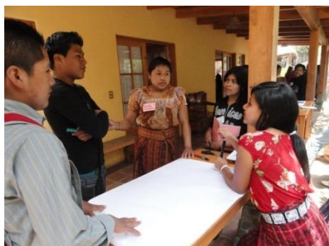
4. Students in the leadership project brainstorm on possible project

In 2011 three students have left their studies for diverse reasons. Before each student withdrew from studies, the Education Program Coordinator was actively advocating for each student to finish his or her studies. We hope to see these students return to school in 2012. Students unfortunately left the program due to diverse reasons such as teenage pregnancy and discrimination experience in the educational institution. Although the Coordinator was able to give guidance and support to these students they ultimately decided to discontinue their studies.