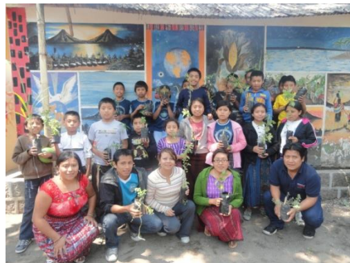
1 Teachers and Students in Santiago receive education about medicinal plants