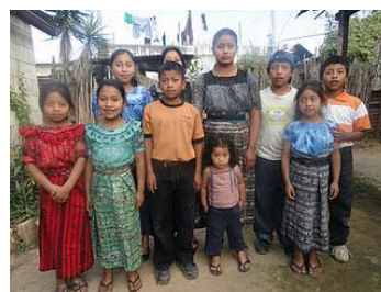
3 Scholarship students from Santa Clara

2011 is the 15 th year that FTM is able to offer scholarships to the children of the women artisans with who we work. With the support of MEF and other individual donors we are proud to be able to continue to invest in the personal and professional development of indigenous children and youth. Through a holistic program FTM is positively contributing to the development of successful, empowered and socially conscious youth that will affect change in their communities.